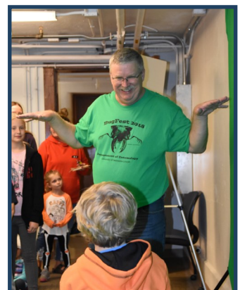
Praying mantid (kind of)