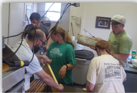
Extracting honey in September at Mead