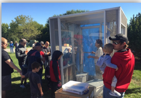
Beekeeper in a Box at AppleJack Festival