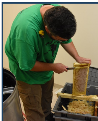
Bees and Honey