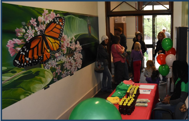
The calm before the storm - the main entrance of Entomology Hall before 800 people come on in!

Over 800 people attended BugFest this year, despite rainy weather again! Bug Fest is a day to let our department show the public how cool insects really are, and for bug lovers from all over to come and meet us. New this year was Story Time, The Insect Sight and Sound Challenge, Insect Art, Build-A-Bee (Habitat), Face Painting, Insect Genetics, and Keying Out Insects. Returning by popular demand were Invasive Insects, The Insect Zoo, Nebraska Insects, How Insects Eat, Edible Insects, A Fly Went By, Salt Creek Tiger Beetle rearing at the Omaha Zoo, Honey Bees and Native Bees, Scientific Illustrators, Bronco Bugs, Mites Be Cool, Life in a Dung Pat with the State Museum Science Ambassadors, and the Bed Bug Roadshow. See you next year!